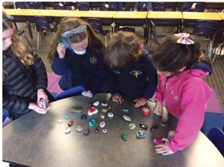
A few third-grade students with their "kindness rocks."